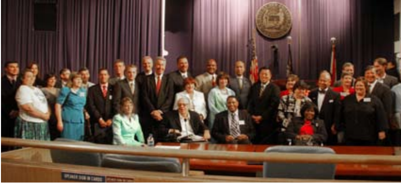
Participants at the signing ceremony included Mayor Ray Nagin, U.S. Attorney Jim Letten, Assistant Attorney General Kim, members of the New Orleans City Council, representatives of the Mayor's Advisory Council for Citizens with Disabilities, and staff of The Advocacy Center and the Department

plans that include provisions for accommodating people with disabilities.