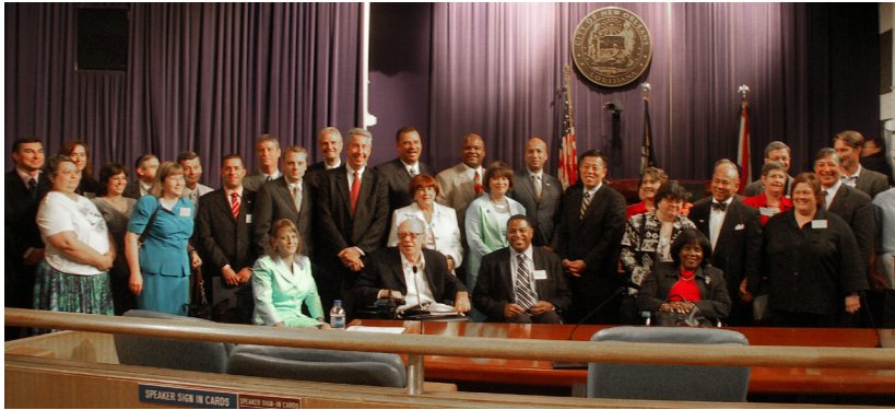
Participants at the signing ceremony included Mayor Ray Nagin, U.S. Attorney Jim Letten, Assistant Attorney General Kim, members of the New Orleans City Council, representatives of the Mayor's Advisory Council for Citizens with Disabilities, and staff of The Advocacy Center and the Department

plans that include provisions for accommodating people with disabilities.