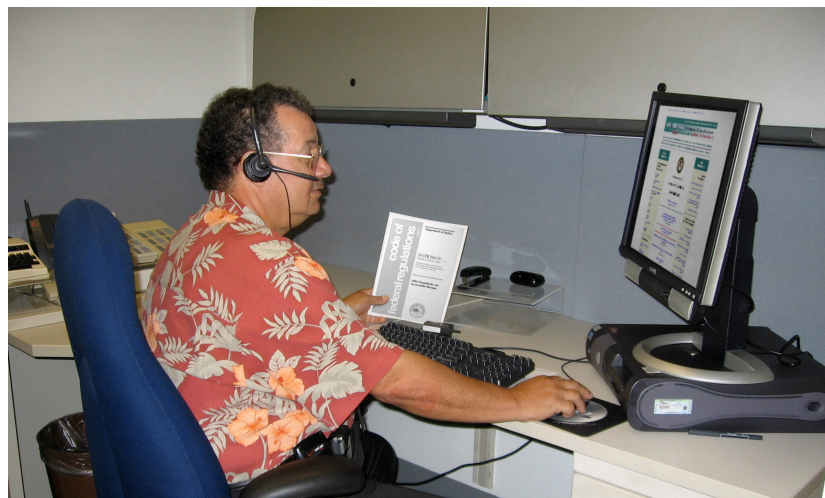
ADA Specialist answering a call to the ADA Information Line