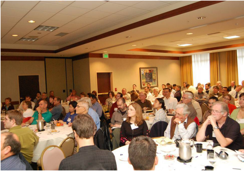
Audience at Access Forum in Seattle

the federal Fair Housing Act's accessibility requirements and to celebrate partnerships that have successfully produced accessible multi-family housing in which everyone profits – developers and consumers alike. The theme of the event is "Good Access is Good Business." Previous events were held in Miami, Minneapolis, Phoenix, Atlanta, Dallas, and Washington, DC.